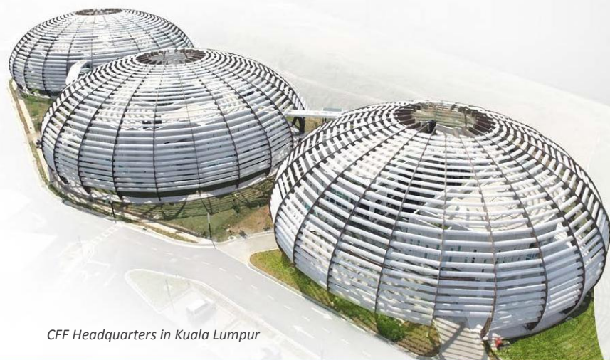
CFF Headquarters in Kuala Lumpur

We give no assurance that information in this document is current, and take no responsibility for matters arising from changed circumstances which may affect the accuracy of information provided.