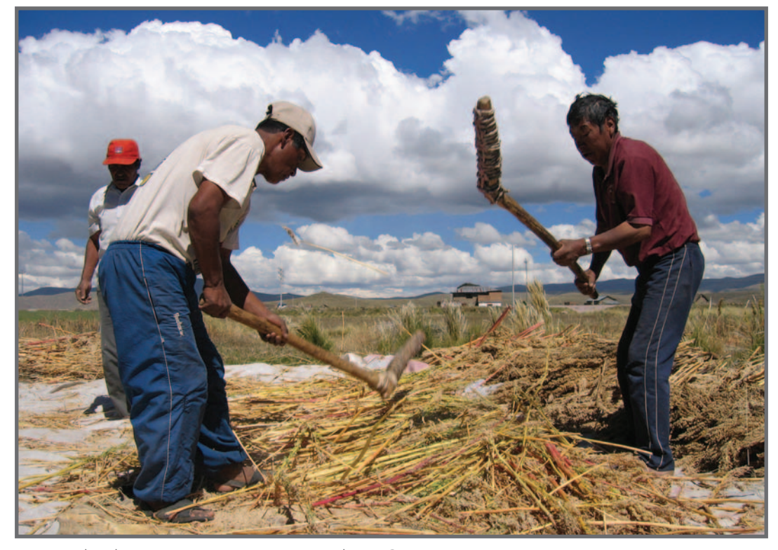
Farmers threshing quinoa near Puno, Peru.

Effective strategies must be based on collective action involving researchers, development practitioners, grassroots organizations, decision-makers and the private sector. The proper management of agricultural activity in light of climate change is critical to creating, maintaining and restoring the healthy landscapes that are fundamental not only for feeding and nourishing the people of the world, but also for ensuring that the planet remains a thriving home to the complex web of microbial, plant and animal life it supports.