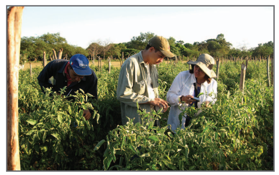
Training university students to identify and collect Orius spp in a tomato field in Nicaragua.

Integrated policy approaches in less-developed countries mean that environmental and production goals must be balanced with equity and poverty alleviation concerns to advance towards healthy landscapes and improved human wellbeing. The sustainability of such initiatives depends on an