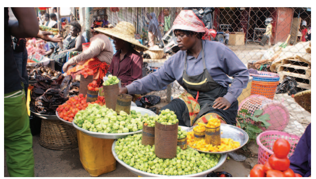
Capsicums and peppers in a Ghanaian market.

After three years of project interventions, there was a significant – and in some communities, even dramatic – increase in household income, and an expansion of the area under traditional crops. This was attributed to the availability of improved germplasm, enhanced skills and awareness of market opportunities and product development, and an increase in farm-gate prices.