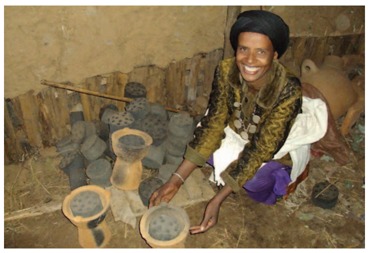
Cultivating bamboo provides both a carbon sink and an alternative source of charchoal.

Over 600 hectares of new bamboo have been planted in Ethiopia and Ghana since 2009, 10,000 hectares of existing stands have been placed under management, 4,000 individuals have been trained in production processes, and 550 tons of bamboo charcoal have been produced. More than 10,000 households have started using bamboo for fuel – a significant step towards sustainable, renewable energy use.