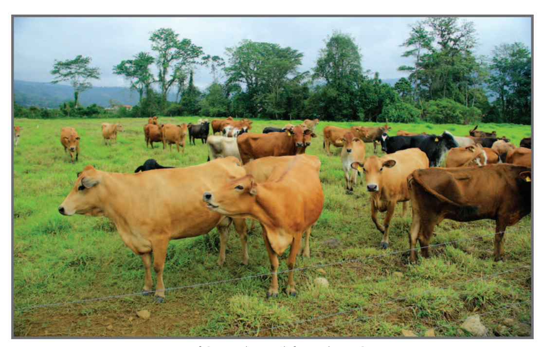
Trees are an important component of CATIE's livestock farm.

However, these changes can also create opportunities. Consumption of more fruit and vegetables as part of an overall strategy to overcome malnutrition is particularly important, as they are sources of a range of vitamins, minerals and other beneficial dietary components that reduce the risk of obesity and chronic diseases, including diabetes, cardiovascular diseases and cancer (Yang and Keding, 2009). Growing vegetables in home gardens is the most direct way for many rural and urban poor families to obtain a variety of nutrient-rich foods, and provides an alternative to vegetable production at commercial scale, which competes for water supplies with industrial and residential users. Taking a broader landscape approach can help these communities capture such opportunities responsibly, by avoiding practices which degrade the environment or put consumer health at risk such as the use of untreated human waste water, compost with high heavy metal contents and indiscriminate application of inorganic fertilizer or pesticides.