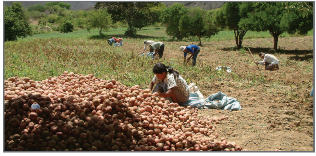
Farmers harvesting potatoes in Bolivia.