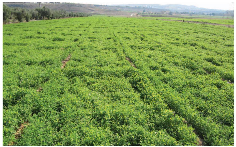
Alfalfa forage crop irrigated with treated waste water in Jordan, 2011.

In Central Asia and Caucasus, ICBA works with farmers to test salt-tolerant crops on their farms. Similar models have used in Jordan and Tunisia, where national governments have disseminated project outputs in a community-based expansion programme. In Turkmenistan, ICBA is working with farming communities to reclaim marginal lands by using NCW resources and indigenous salt-tolerant tree species.