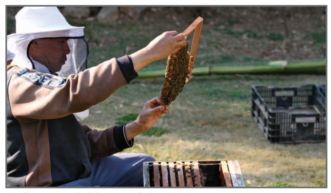
A beekeeping trainer checks hives in Nepal.

Climate change adaptation also requires the development of mechanisms to monitor changes and track the spread of pests, diseases and invasive species in order to make science-based projections regarding impacts and threats (Keatinge et al., forthcoming), together with the use and protection of natural resources that are essential for providing ecosystem services beyond the farm scale (e.g. for biological corridors). To achieve change, impact perceptions and current or previous local adaptation practices need to be understood in order to ensure appropriate development, validation and incorporation of new approaches. This must also be set within the context of national policies and institutions. The adaptive co-management of watersheds or rangelands provides examples of existing mechanisms for climate proofing (Finegan et al., in press).