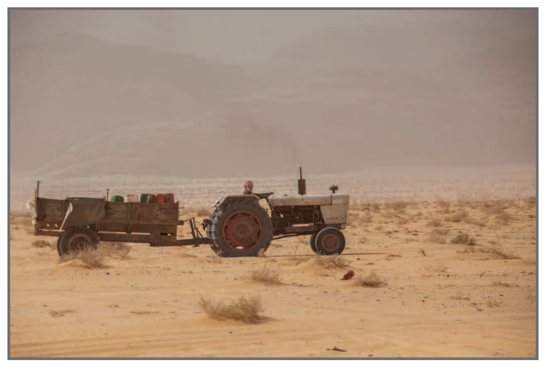
Water being transported in arid Wadi Rum, Jordan.

In order to promote wider understanding and adoption of landscape approaches, AIRCA recommends that international development organizations, donors, investors and governments support the following three priority areas: