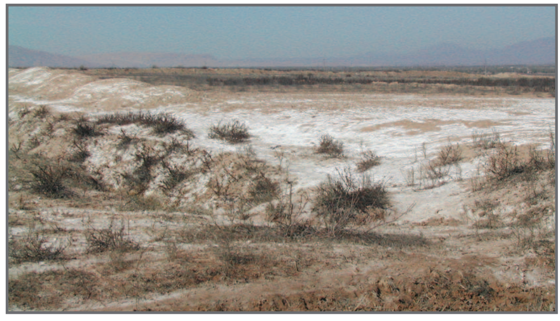
Land affected by salinity in Tajikistan.

Not only is agricultural land salt-affected. Both the quality and quantity of irrigation water is also constrained. In some cases, there is not enough fresh water available to sustain any irrigated agricultural production system, whereas, in other cases, the quality of available water is not suitable