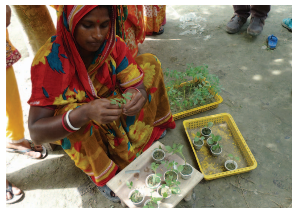
Grafting tomatoes in Bangladesh provides income for women.

AVRDC also works to support school gardens, which directly engage students in growing their own food, preparing meals and understanding the process of how food arrives at the table, as well as offering daily lessons in agriculture, biology, economics and resource management. School garden harvests enrich cafeteria meals, providing nutrition that may be lacking in students' home diets. In 2012 the Philippines, which has the lowest vegetable consumption in Asia, mandated the creation of school gardens in all public schools, modelling its programme after an AVRDC school garden pilot project in Luzon.