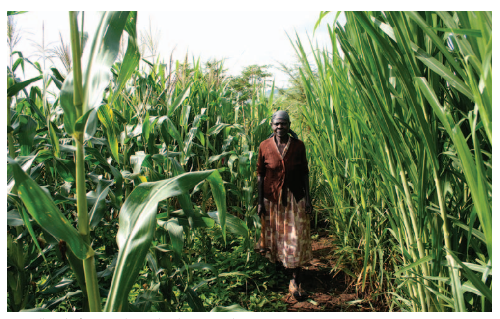
A small-scale farmer admires her better-quality maize crop in Western Kenya.