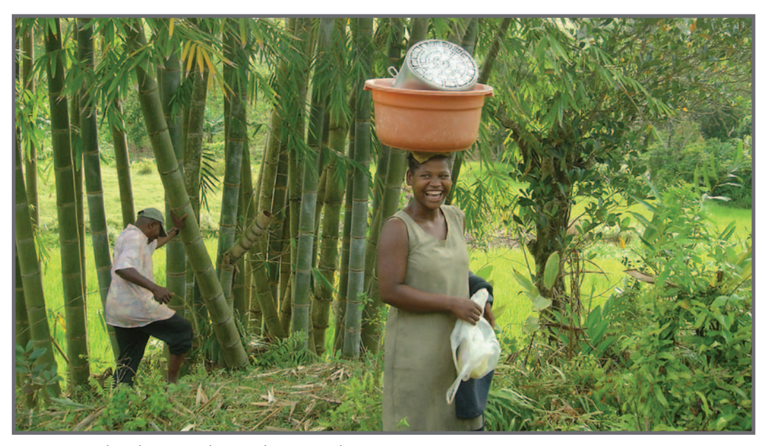
Farmers at a bamboo stand in Madagascar.