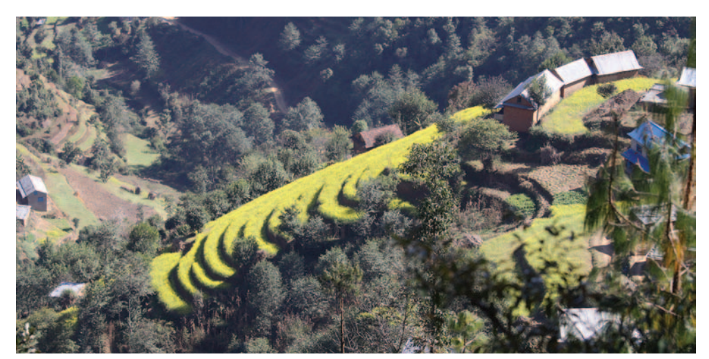
A view of Lakuri Bhanjyang, Lalitpur District, Nepal.

One example is the Khangchendzonga Landscape initiative, which aims to promote transboundary biodiversity and cultural conservation, ecosystem management, climate change adaptation and sustainable development. During the consultative planning process, special emphasis was given to identifying appropriate land cover for biodiversity conservation, while at the same time mapping land use to identify sustainable livelihood practices. Agriculture-based livelihood opportunities include cultivation of high-value products and their associated value chains, agroforestry, use of agrobiodiversity for crop diversification, and use of agro-based products in ecotourism.