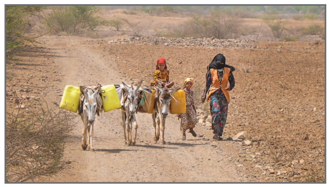
A mother and her two daughers carrying water home in rural Yemen.